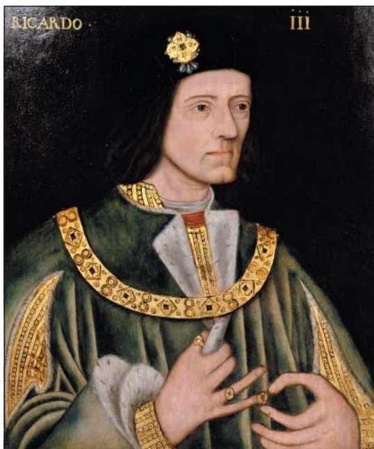
Conscience, for Shakespeare's Richard III, was "but a word cowards use"

that is, paternalism. Their values crept into clinical decisions. 1,2 This has been squarely overturned by greater patient participation in decision making and the importance given to respecting patients' autonomy. 3 More recently, doctors' values have reappeared as a right to conscientiously object to offering certain medical services. Examples include, refusal to offer termination of pregnancy, especially late term termination, to women who are legally entitled to it and refusal to provide reproductive advice and help to gay couples, single women, or others deemed socially unacceptable.